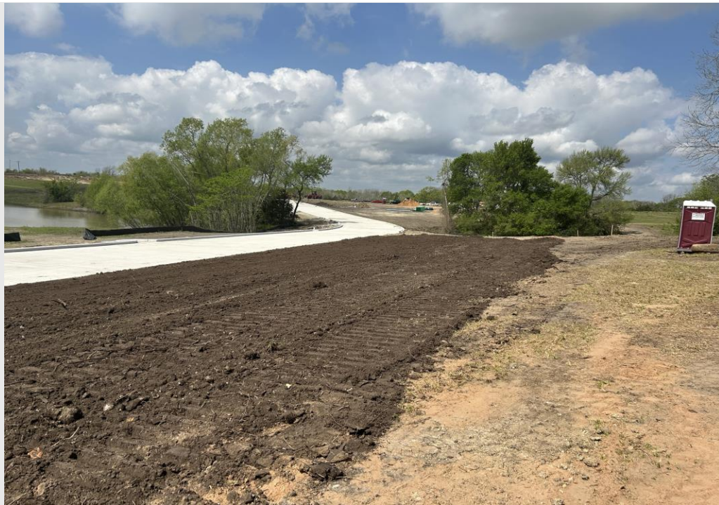
Access Road Behind HS