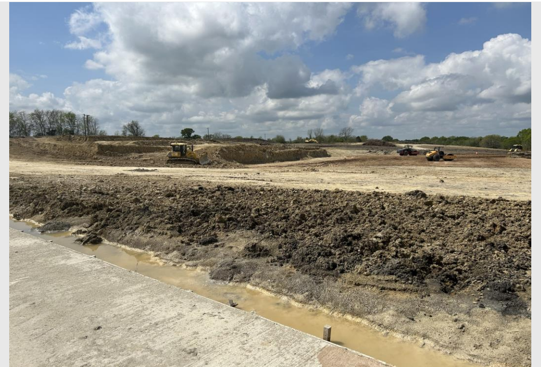
New ES Site Clearing