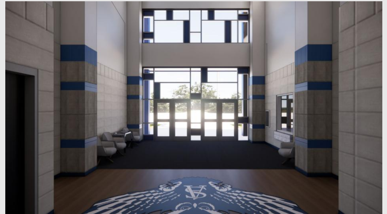
Front Entrance Rendering