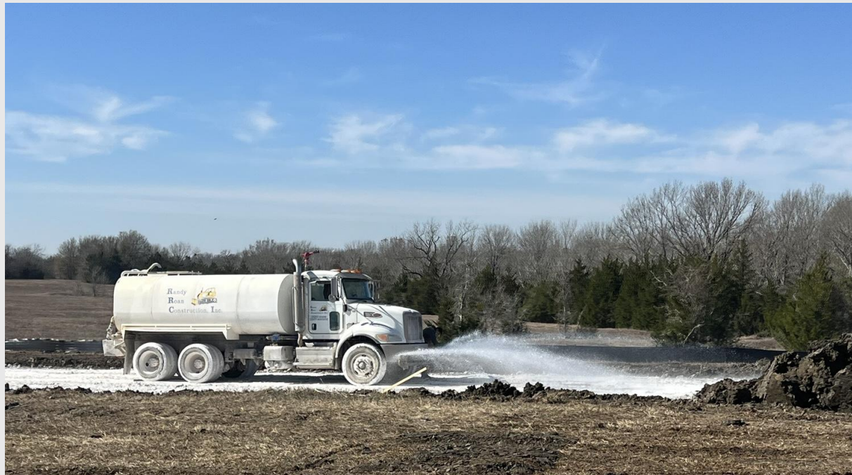
West Side of HS/JHS