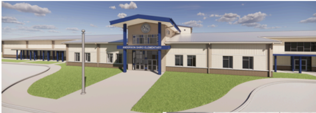
Front Entrance Rendering