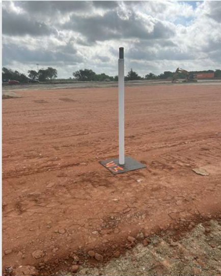
New ES footprint with select fill