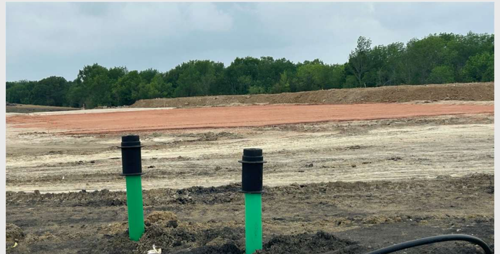
New ES Site Work