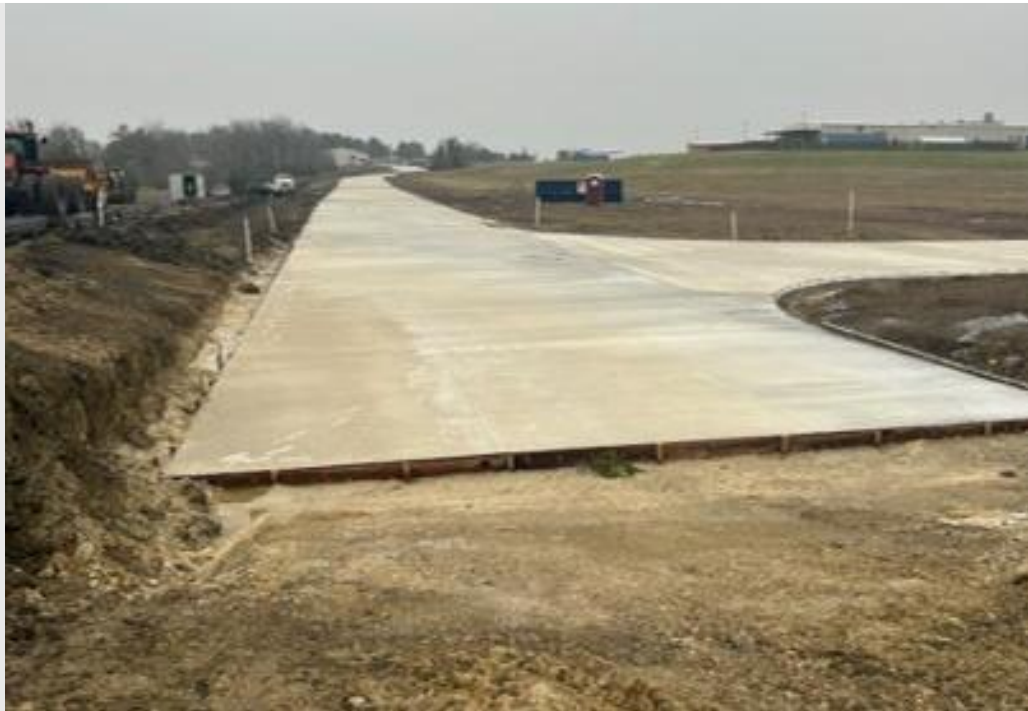
New ES Intersection